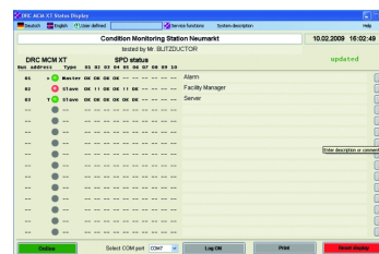
DRC MCM XT status display software

DIN rail mounted device with integrated LifeCheck sensor for condition monitoring of max. ten LifeCheck-equipped BLITZDUCTOR XT / XTU arresters. Visual operating state indication via three-coloured LED combined with remote signalling function (break or make contact). An RS 485 interface allows to connect up to 15 DRC MCM XT.